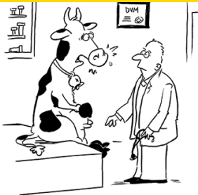
"Every time I eat hay, I get hay fever."