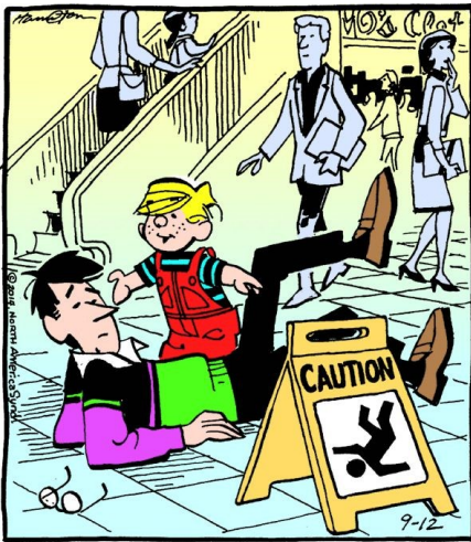
"YOU LOOK JUST LIKE THE GUY IN THAT PICTURE, DAD."