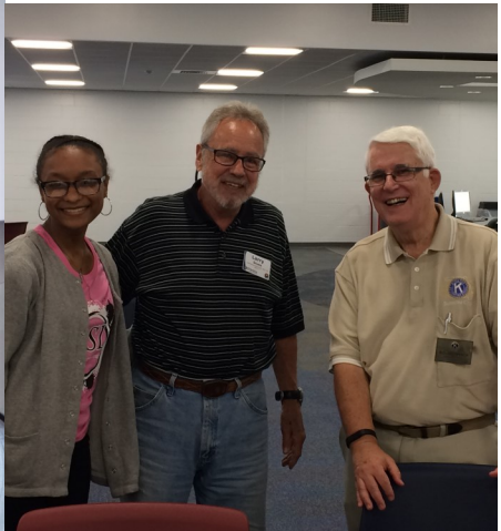
Lakewood Key Club

The Sunshiner is partially underwritten by sponsor: