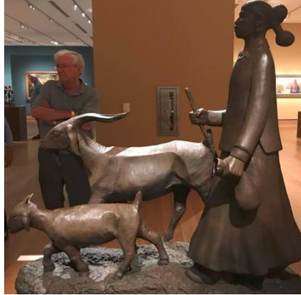
James Museum Social

Don't be late for this very important date! Mad Hatter Tea Party, September 30, Sunday.