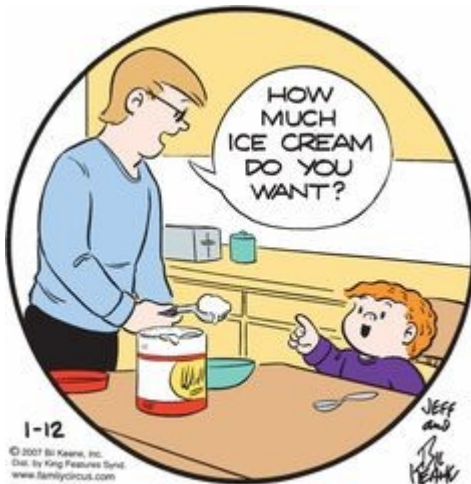
1-12