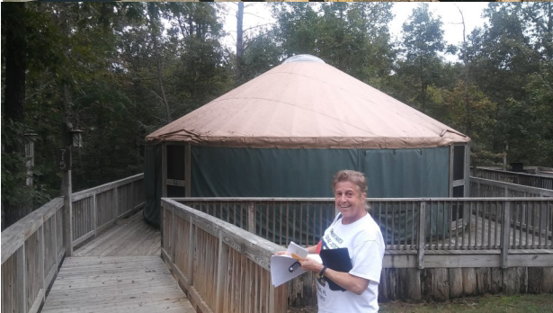
...glamping at Charlottesville, VA